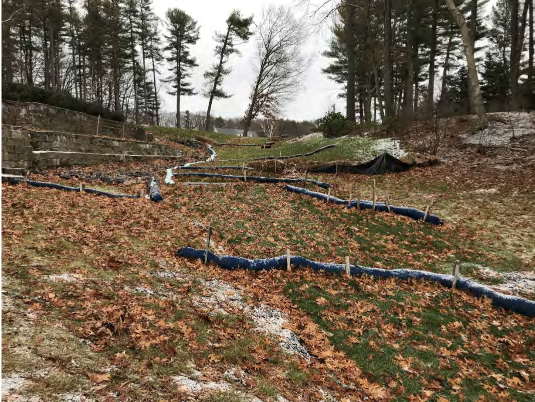
Fig 13: Slope below the manhole at Gundalow Landing/east side of the bay. Viewing east. (01-05-21)