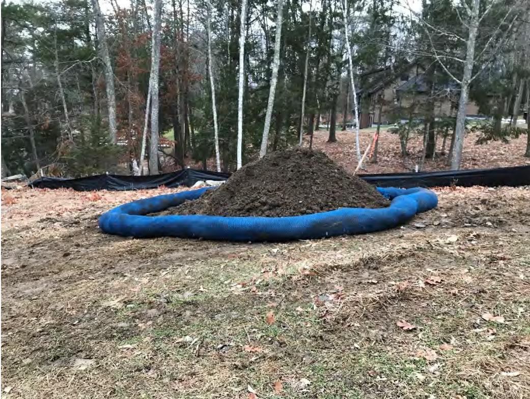
Fig 7: Temporary loam stockpile at the Eversource property/west side of the bay. Viewing south. (01-05-21)