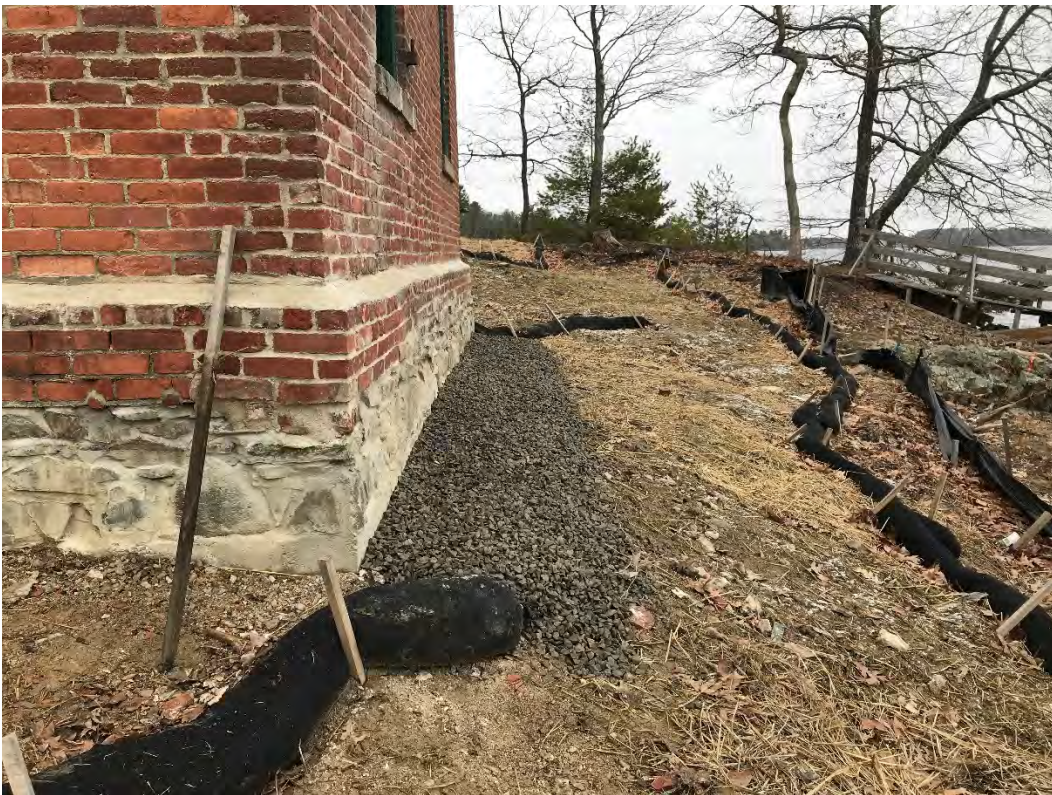
Fig 6: Gravel drip line installed along eastern side of the cable house at Eversource property/west side of the bay. Viewing north. (01-05-21)