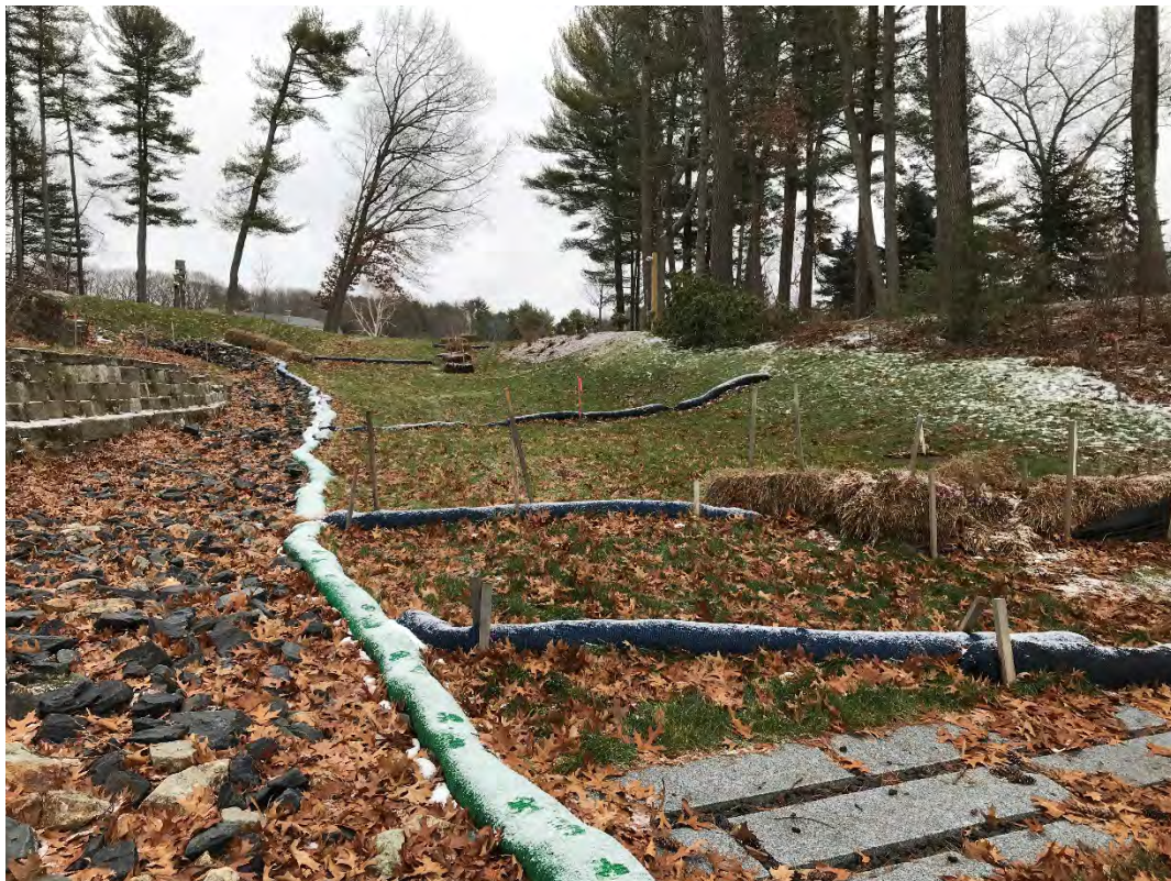
Fig 12: Slope above the manhole at Gundalow Landing/east side of the bay. Viewing east. (01-05-21)