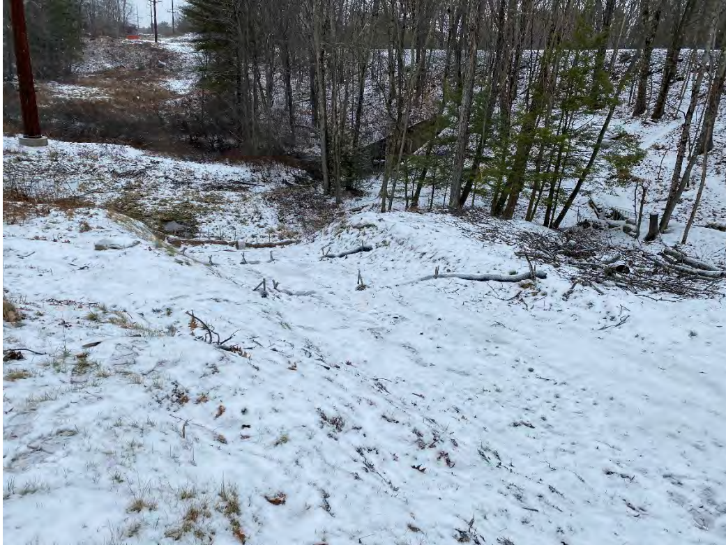
Fig 11: Lower portion of slope between Strs. 28 and 29. Viewing northeast. (01-05-21)