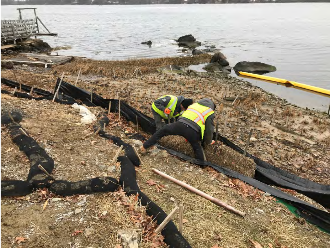
Fig 5: Restoration of the toe of slope below the cable house at the Eversource property/west side of the bay. Viewing east. (01-05-21)