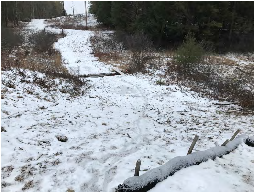
Fig 10: Stream DS46 between Strs. 51 and 52. Viewing northeast. (01-05-21)