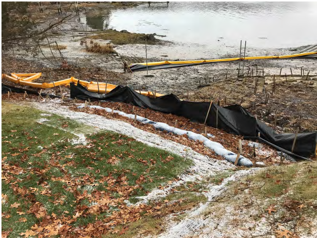
Fig 14: Toe of the slope at Gundalow Landing/east side of the bay. Viewing south. (01-05-21)