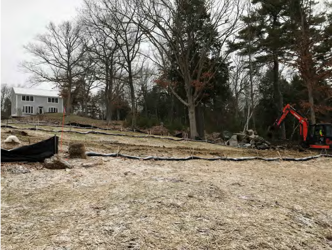
Fig 1: Removal of debris from pile on the slope above the cable house at the Eversource property/west side of the bay. Viewing northwest. (01-05-21)