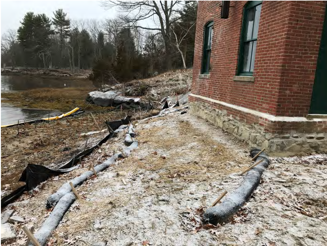
Fig 3: Slope between the cable house and salt marsh restoration at the Eversource property/west side of the bay. Viewing south. (01-05-21)