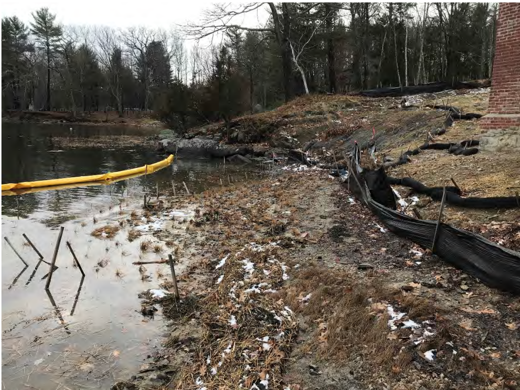
Fig 4: Toe of the slope and salt marsh restoration at the Eversource property/west side of the bay. Viewing south. (01-02-21)