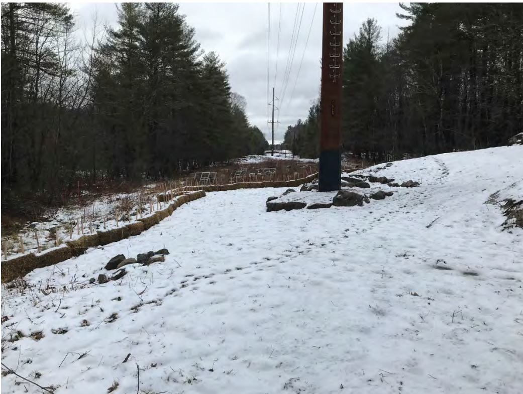
Fig 8: Str. 89 work area. Viewing southeast. (01-02-21)