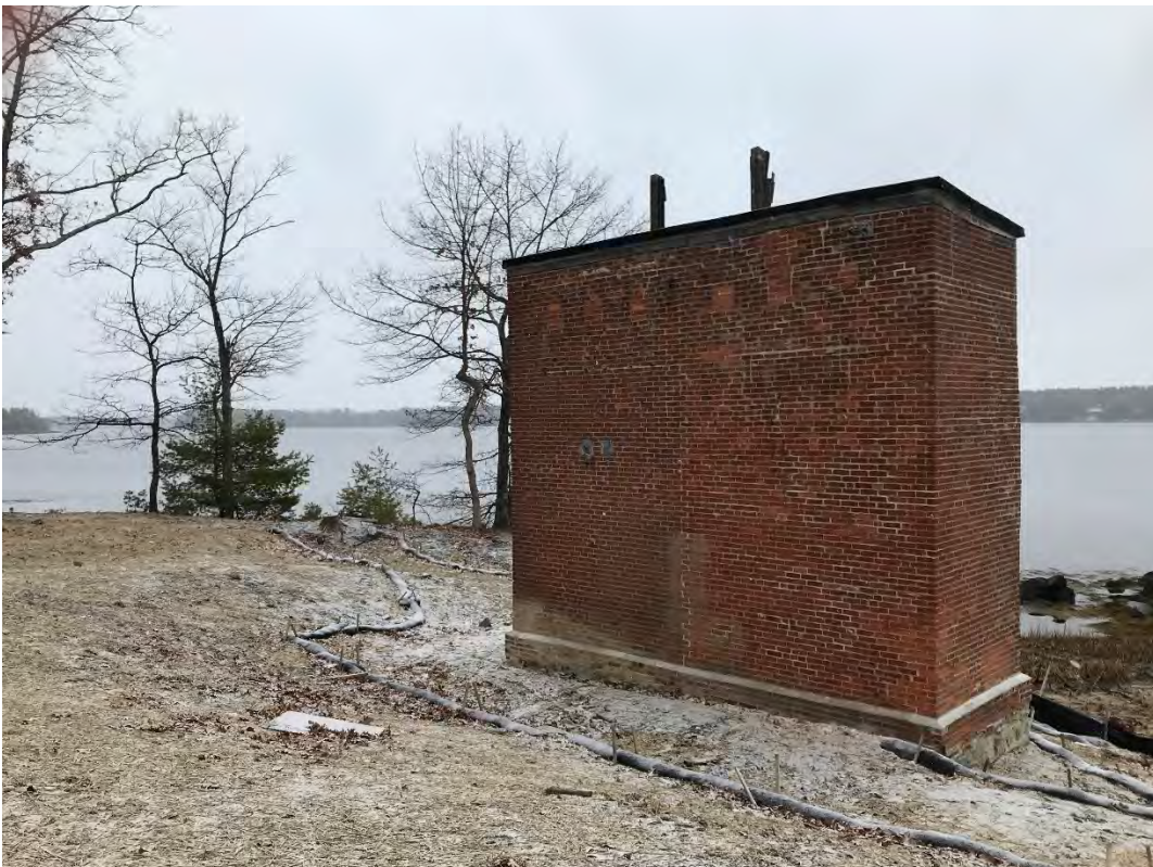
Fig 2: Slope leading down to cable house and salt marsh restoration at the Eversource property/west side of the bay. Viewing northeast. (01-05-21)