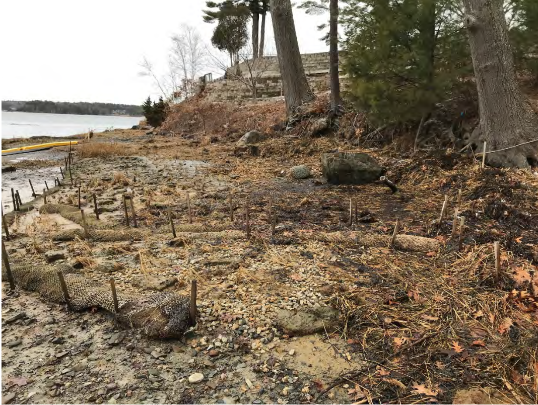
Fig 15: Salt marsh restoration at Gundalow Landing/east side of the bay. Viewing northwest. (01-05-21)