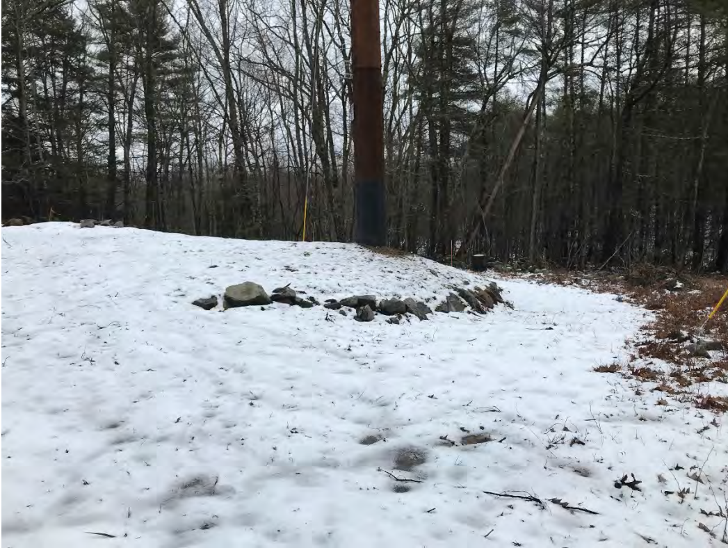
Fig 9: Str. 90 work area. Viewing northeast. (01-02-21)